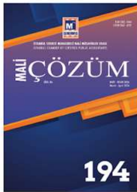
↓ MALİ ÇÖZÜM DERGİSİ (Sayı 194) MART-NİSAN 2026