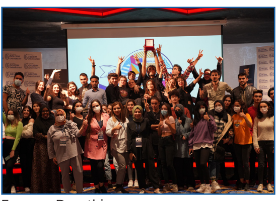
Erasmus Days this year.

Many students from different nationalities come together at the Erasmus Days event. The students participating in the workshop activities both provide cultural interaction and emphasize that it is possible to work and live together regardless of language or religion. Students have the chance to participate in various activities from yoga to Italian cuisine, from Turkish music to world music.