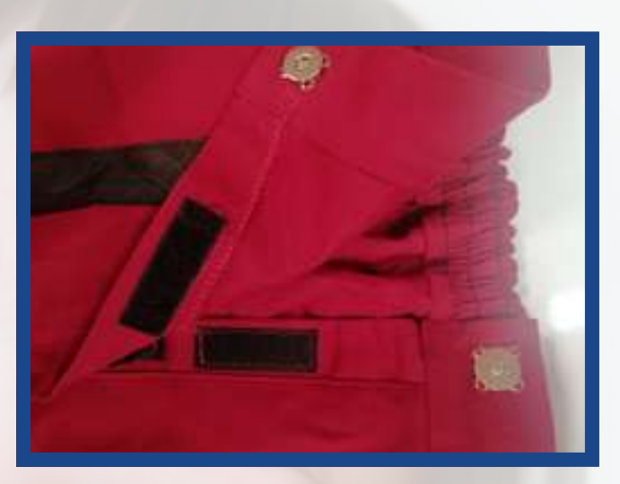
Image 5: Design trousers with metal buttons with Velcro and magnets as a function

Appearance and the way of dressing are thought to be an important factor in being recognized by or with others. The physical appearance of disabled people is also important. It is thought that by meeting their functional appearance needs, they will not look privileged and will be happier when they wear clothes that look similar to healthy individuals (Yoder and Morgado, 1985:34-37).