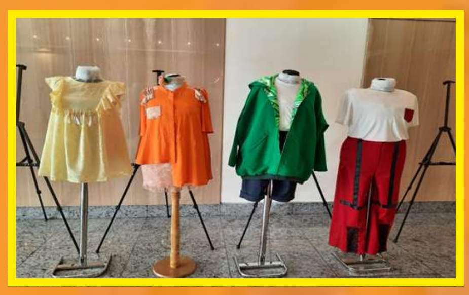
Görsel 1: Examples of functional design clothes produced for children with Down Syndrome

In a study, when children with Down Syndrome had to choose a single color, they preferred the color 'red' the most, then the 'orange' color and finally the 'yellow' color at the lowest rate (Ece and Çelik, 2008). In the same study, in multiple choice color the preferences of children with Down Syndrome, "green-blue" is in the first place, while the following color preferences are "red-orange" and "green-yellow", respectively.