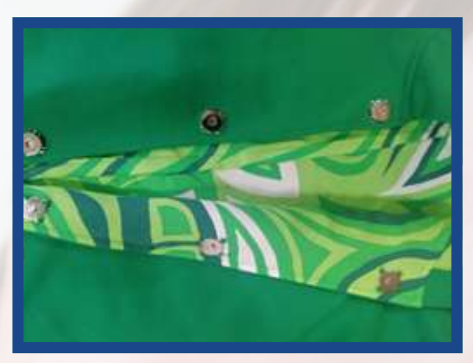
Image 4: The preferred design sweatshirt with magnetic metal buttons as a function