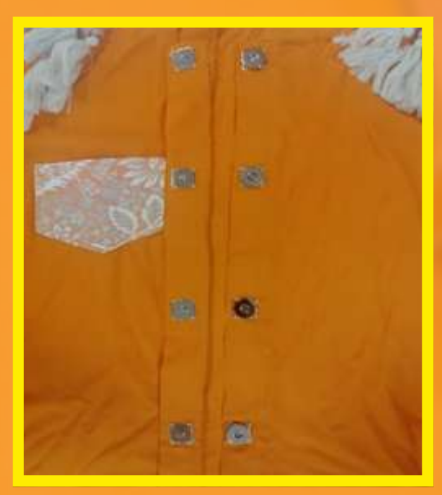
Image 2: Design shirt with magnetic metal buttons preferred as a function

In these clothes, which were produced in the pilot application, accessories were preferred that will enable DS children to easily take off and wear the clothes without the need for another individual.