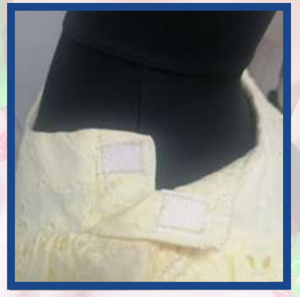
Image 6: Design dress in which Velcro is preferred as a function in the neck opening

In the light of the scientific information obtained as a result of the study, it is expected that this case study, which aims to minimize the dressing problems of children with down syndrome, will guide similar studies, raise awareness, and the approach of providing services for children with down syndrome will be adopted by the ready-made clothing industry and create a market.