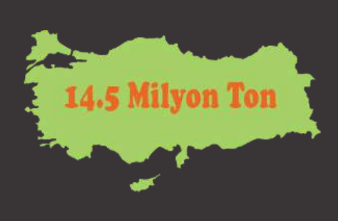
Ülkemizde bir yılda toplanan 33 milyon ton çöpün 14.5 milyon tonu gıdal