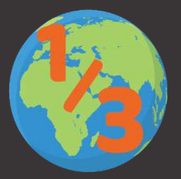
ler yıl dünyada üretilen gıdanın Jaklaşık üçte biri izraf ediliyor.

Today, 1 out of every 3 foods produced in the world goes to waste, this waste accounts for 8% of carbon emissions that cause climate change. Reducing food waste creates a positive social and environmental impact as well as economic benefits.