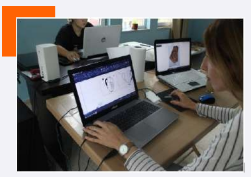
Studies Carried Out in Çobankale Artifact Warehouse