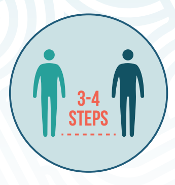
CLOSE CONTACT SHOULD AVOID LIKE HANDSHAKE AND HUGGING.